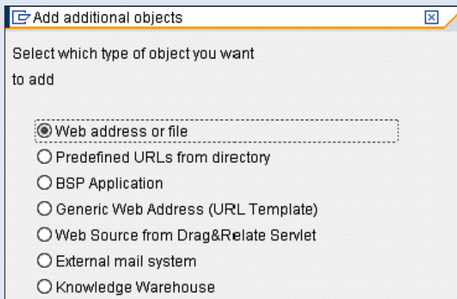
Figure 3 Add other objects to favorites

This seemingly simple but extremely powerful feature can improve productivity significantly, especially when it involves a large user base, such as major upgrade projects. The SAP project team can create the favorites for specific roles and download the favorites as text files. They can then forward the files to the large user base and the users can simply upload these favorites to their own menus. This way, within a short time, the favorites can be replicated to the entire user community. You can significantly mitigate the go-live pains during upgrade projects — when every minute counts.