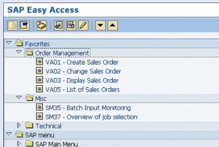
Figure 2 Organize your Favorites transactions